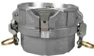
Type D Coupler Coupler x Female NPT