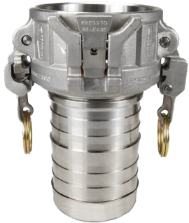
Type C Coupler Coupler x Hose Shank