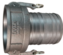
unplated ductile iron