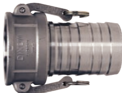
316 stainless steel